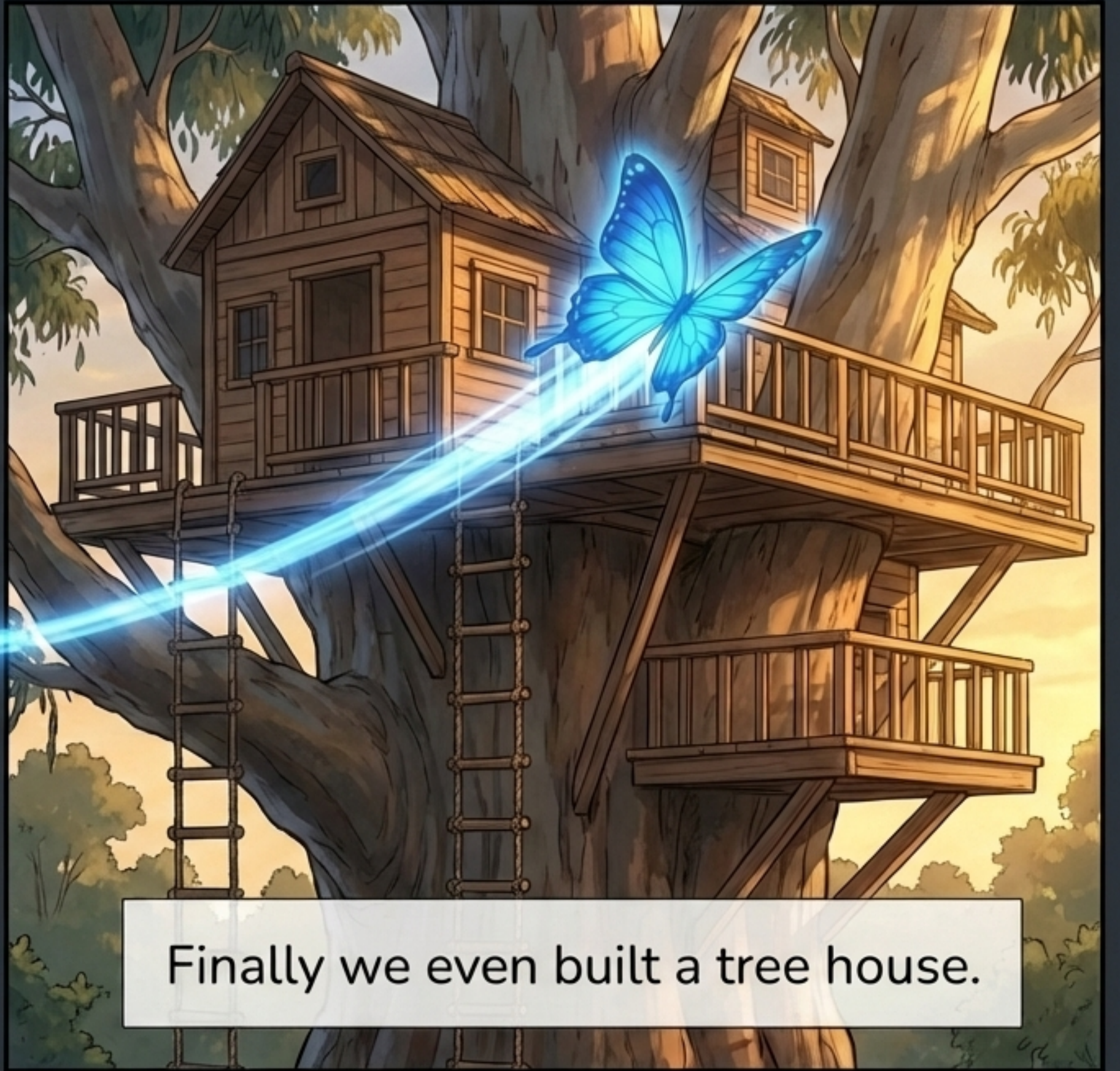
Finally we even built a tree house.